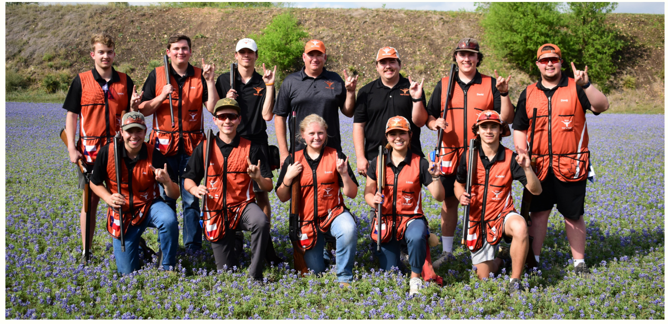
Baskin' in the Bluebonnets. (NSC, Mar. 22) Pictured Above: The TXTS Competitive Team